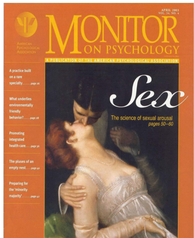
Figure 1. April 2003 American Psychological Association Monitor on Psychology cover (color figure available online).

One decade of literature on backlash effects offers what is likely an important part of the reason (Rudman & Glick, 2008). Backlash is defined as penalties for counterstereotypical behavior (Phelan & Rudman, 2010; Rudman & Fairchild, 2004). During childhood, boys and girls receive a great deal of pressure from parents, peers, and other role models to adhere to gender norms (e.g., Egan & Perry, 2001). As adults, men and